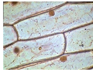
Figure 1: Cells

2. a) Classify the cells in Figure 1 plant or animal cells. b) Explain your reasoning.