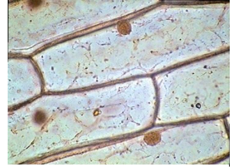
Figure 1: Cells

2. a) Classify the cells in Figure 1 plant or animal cells. b) Explain your reasoning.