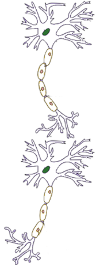
Image II - The Anatomy of a Synapse

On a cellular level, the neuron cell has vesicles that contain the neurotransmitters. Each neurotransmitter can carry a different type of message. Some neurotransmitters, like serotonin, regulate appetite, sleep and mood. Serotonin is thought to be associated with certain types of depression and anxiety disorders.