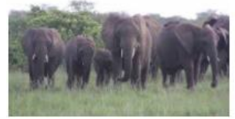
A herd of elephants